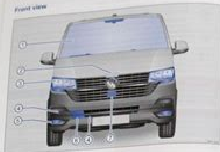
Fig. 2 Overview of the front of the vehicle