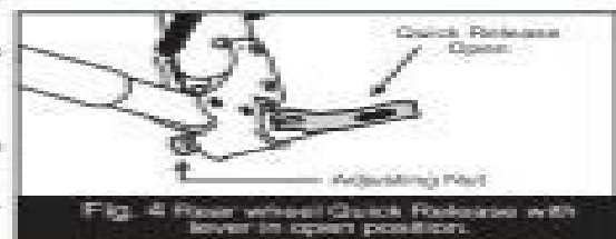
Fig. 4 Rear wheel Quick Release with lever in open position.