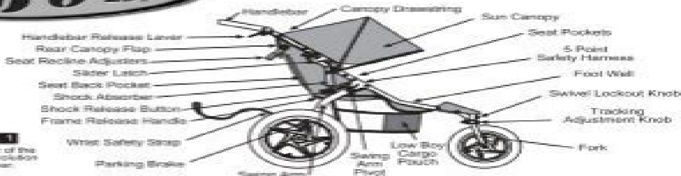
Fig. 1 Anatomy of the BOB Revolution Stroller.

BOB is a company that produces high quality products, which encourage a healthy, outdoor, car-free life-style. In addition to strollers, we also make single-wheeled cargo trailers for bicycles. See www.bobgear.com for our complete line of products. Before attempting to assemble or use your new stroller, read and understand these operating instructions completely to insure proper assembly and operation. If you are unclear on any point, contact your dealer or BOB before use.