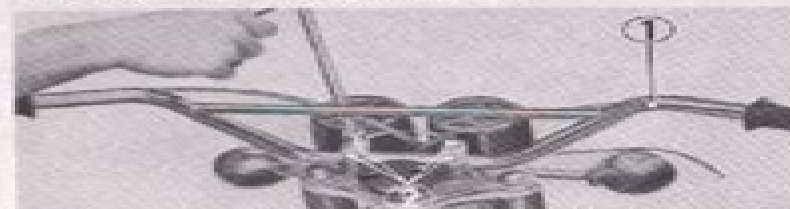
① Steering handle pipe ② 8mm hex. bolt