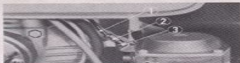
① Throttle cable ② Throttle cable adjuster ③ Lock nut