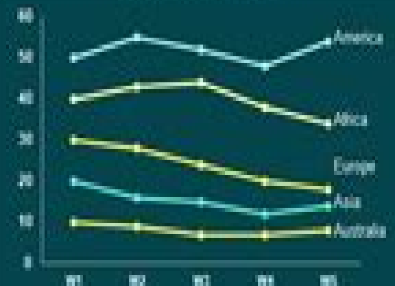
Sales- Last 5 Weeks