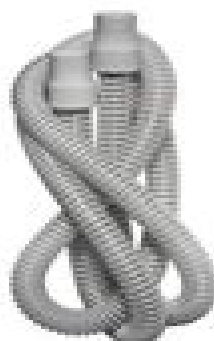
6 ft. Tubing (Alternative option available)