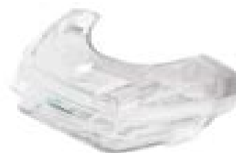
Water Chamber (Alternative option available)