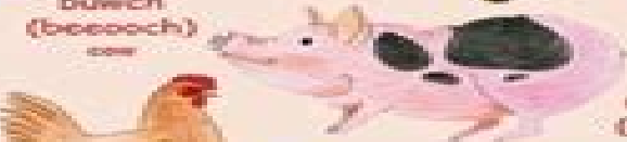
mochyn (mochin) pig