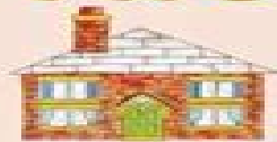
tŷ (tee) house