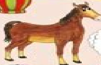
ceffyl (cefil) horse