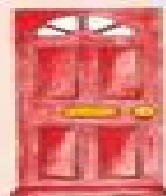
drws (drows) door