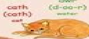
cath (cath) cat