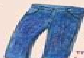
trowsus (trowsis) trousers