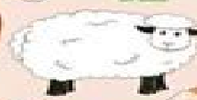
defad (davad) sheep