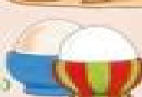
wyau (weas) eggs