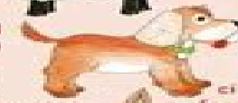
ci (cee) dog