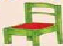
cadair (cader) chair