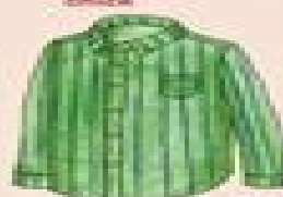
crys (crees) shirt