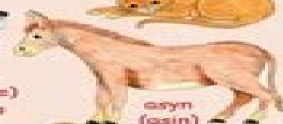
asin (asin) donkey