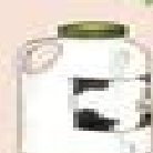
lloeth (cloeth) milk