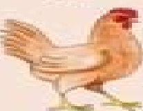
iâr (ya) hen