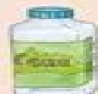
dŵr (d-oo-r) water