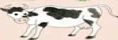
buech (beooch) cow