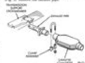
Fig. 7 Exhaust Pipe-to-Catalytic Converter

apply heat until the metal becomes cherry red. Do not remove the exhaust pipe from the catalytic converter (Fig. 5). Remove the exhaust pipe.