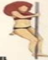
PUSH UP FIREMAN