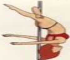
CROSS KNEE RELEASE