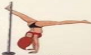
FLOOR BOW AND ARROW