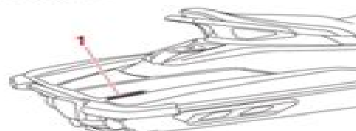
1 Craft Identification Number (CIN) location

The CIN is stamped on a plate attached to the aft deck.