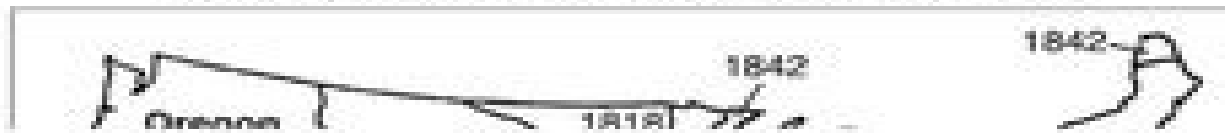
Territorial Growth of the United States (1783–1853)

#1: According to Source 1 and your knowledge of history, which territory acquisition changed the United State's landscape the most? Explain why. Source 1 Map of Western Expansion *