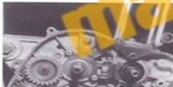
Bild 108 Das Pleuellager wird von nur einer Schraube gehalten (Pfeil).