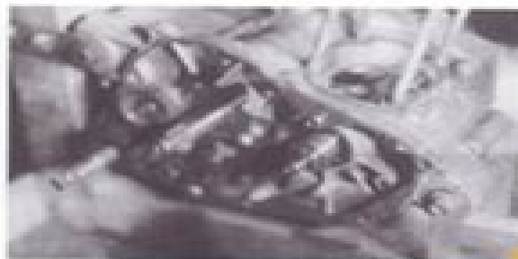
Bild 107 Die Nocken auf dem Kurbelwellenmechanismus sind mit einer Schraube befestigt.