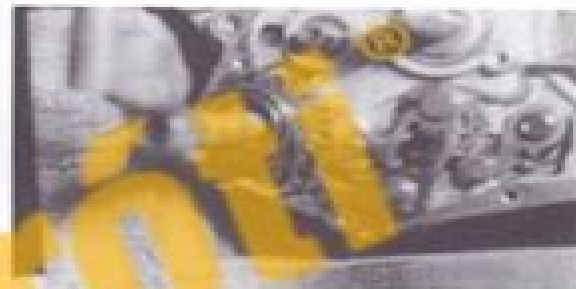
Bild 110 Die Pleuellager-Schrauben können komplett abgebaut werden.