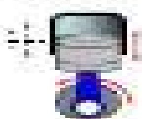
Figure 1: A plot of a sine wave.