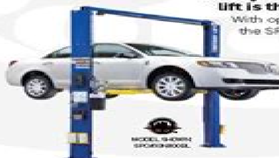
MODEL 94000L SPOA1000L