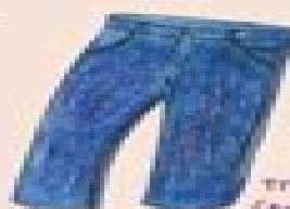
trowsus (trowsis) trousers