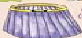
hosanau (hosanau) socks