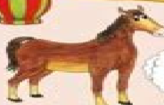
ceffyl (cefil) horse