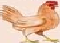
lar (ya) hen