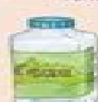
dŵr (d-oo-r) water