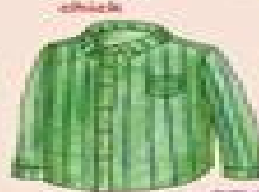
crys (crees) shirt