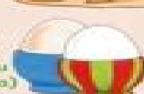
wyau (weau) eggs