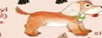
ci (cee) dog