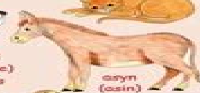
asin (asin) donkey