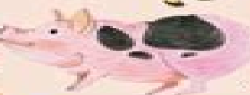
machyn (machin) pig