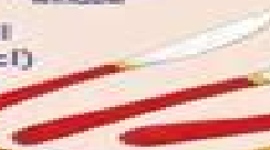
llyw (chwee) spoon