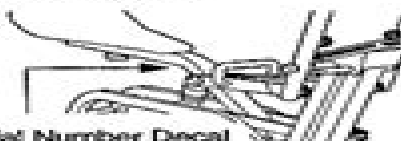
Serial Number Decal

Write the serial number in the space above for reference.